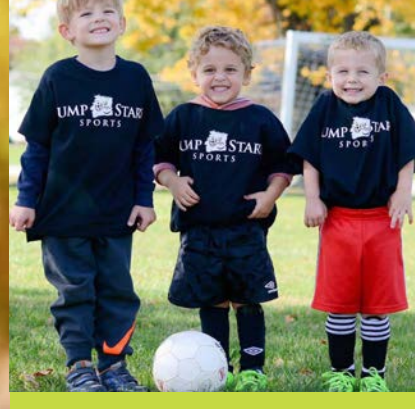
Winter & Spring 2024 Program Guide